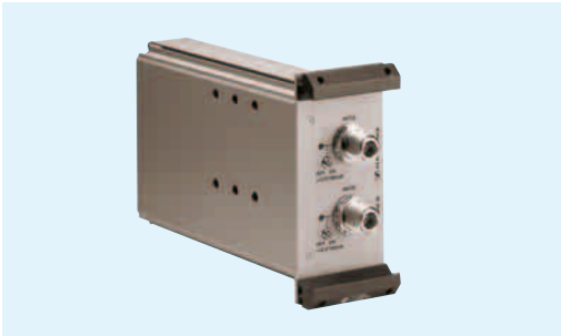
EM 1046 RI RF input module

In systems with the large mainframe, the selective RF input module EM 1046 RI processes the incoming antenna signals. In multi-mainframe systems, the antenna splitter modules described below are connected upstream. Two different hardware versions of the EM 1046 RI are available – one for the UHF band and one for the VHF band. Within the bands, the module is set at the factory to a bandwidth of 24 MHz for the UHF range (7 MHz in the VHF band).