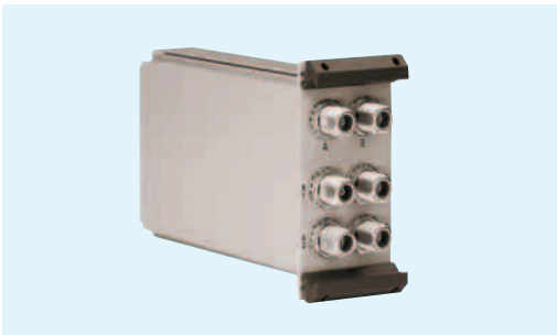
EM 1046 ASP antenna splitter module

The signals within the band are amplified by a typical 14 dB and distributed to the receiver modules via the bus system. The high selectivity and large-signal strength of the RF input module is matched for use in multi-channel systems. The two diversity antenna are connected via N sockets. A supply voltage can be added for antenna boosters or active antenna.